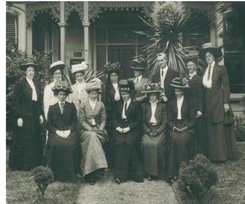
The first meeting of the New Zealand Trained Nurses Association in 1909

NZNO is a complex organisation but the relationship and interconnectedness of all components of the organisation is critical to achieving our goals and realising our vision — that all NZNO members are freed to care and proud to nurse.