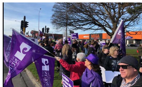
2021 Enrolled Nurses Conference held in Dunedin