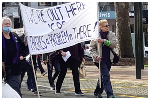
Southern DHB Strike

Further information is also available on Membership Committee (nzno.org.nz)