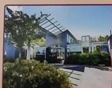
Otago Community Hospice was established 26 years ago. From the beginning there has always been a place for Enrolled Nurses in Hospice.