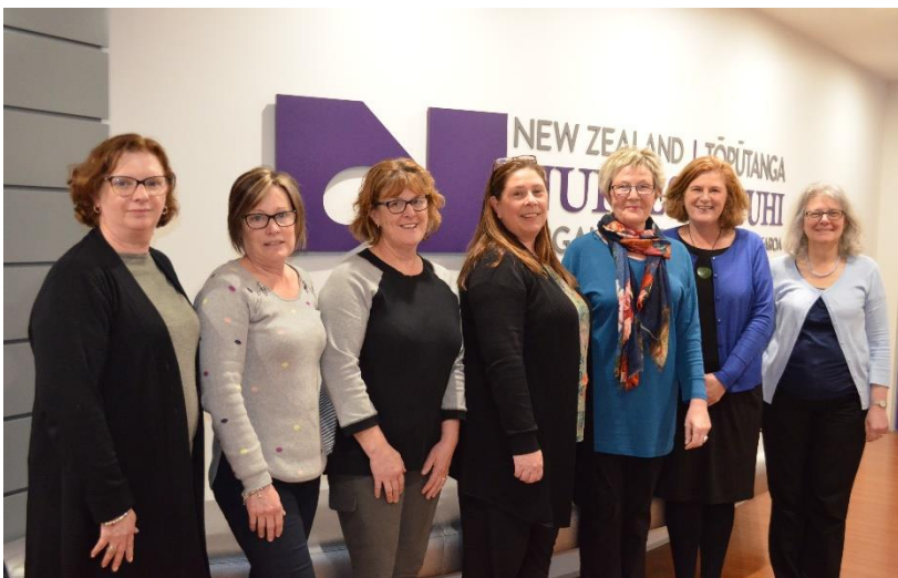
Enrolled Nurse Section committee, August 2020 meeting with Nursing Council of New Zealand