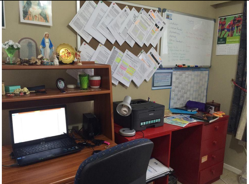
Photo taken 19 June 2016 Study Space at home