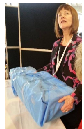
Dr Jane O'Malley Ministry of Health Chief Nurse, feeling the strain during a surgical crate weight lifting trial

The Ministry of Health Chief Nurse, Dr Jane O'Malley was an invited guest at the NZNO conference and kindly agreed to participate in the crate weight blinded trial. On lifting the first crate, Dr O'Malley commented that the weight of the crate was similar to a 7 kg cabin carry bag. The PNC delegates explained that lifting orthopaedic surgical crates is comparable to traveling with 10 cabin bags; lifting each cabin bag at least 3 times; and then taking up to four flights a day. These flights may be scheduled or unscheduled at any time day or night, but instead of resting in flight, the perioperative nurse is scrubbing for an operation which involves repeated lifting and twisting. In addition it is proposed that around a third of surgical crate weights weigh more than the 7 kg recommendation. This analogy helps draw attention to the PNC 7Kg crate weight project, in a way that is relatable to non perioperative personnel. Dr O'Malley agreed that "lifting heavy surgical crates is a serious health and safety concern and applauds the perioperative nurses college for highlighting this issue".