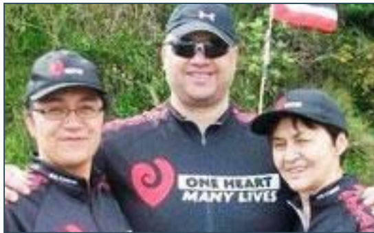
One Heart Many Lives