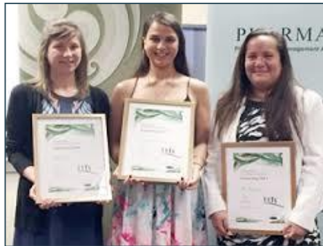
Hiwinui Heke Scholarships