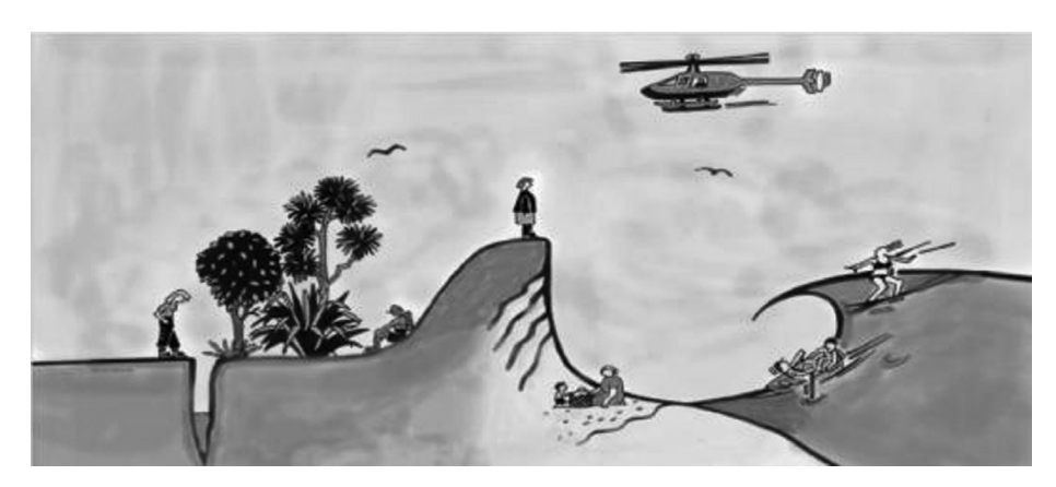
Figure 1 The Wave

Figure 1 depicts a widely utilised structural analysis tool that was introduced to Aotearoa by Father Fanchette from Martinique and was illustrated by Jenny Rankin for the Auckland Workers Education Association.<sup>8</sup>